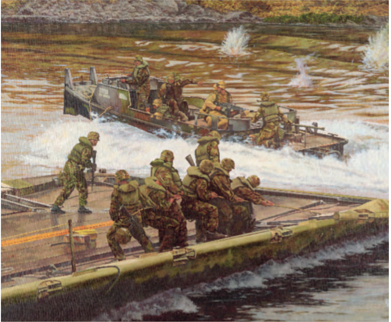
During Operation IRAQI FREEDOM, the 459th Engineer Company (Multi-Role Bridge), an Army Reserve unit from Bridgeport, West Virginia, lays an aluminum float ribbon bridge under enemy fire across the Diyala River southeast of Baghdad. The spearhead of the 1 Marine Expeditionary Force required the crossing in order to expand its dismounted infantry bridgehead with tank support before entering Baghdad. Other missions accomplished by the 459th included bridging the Euphrates River and convoy security. (An Army Reserve Historical Painting)