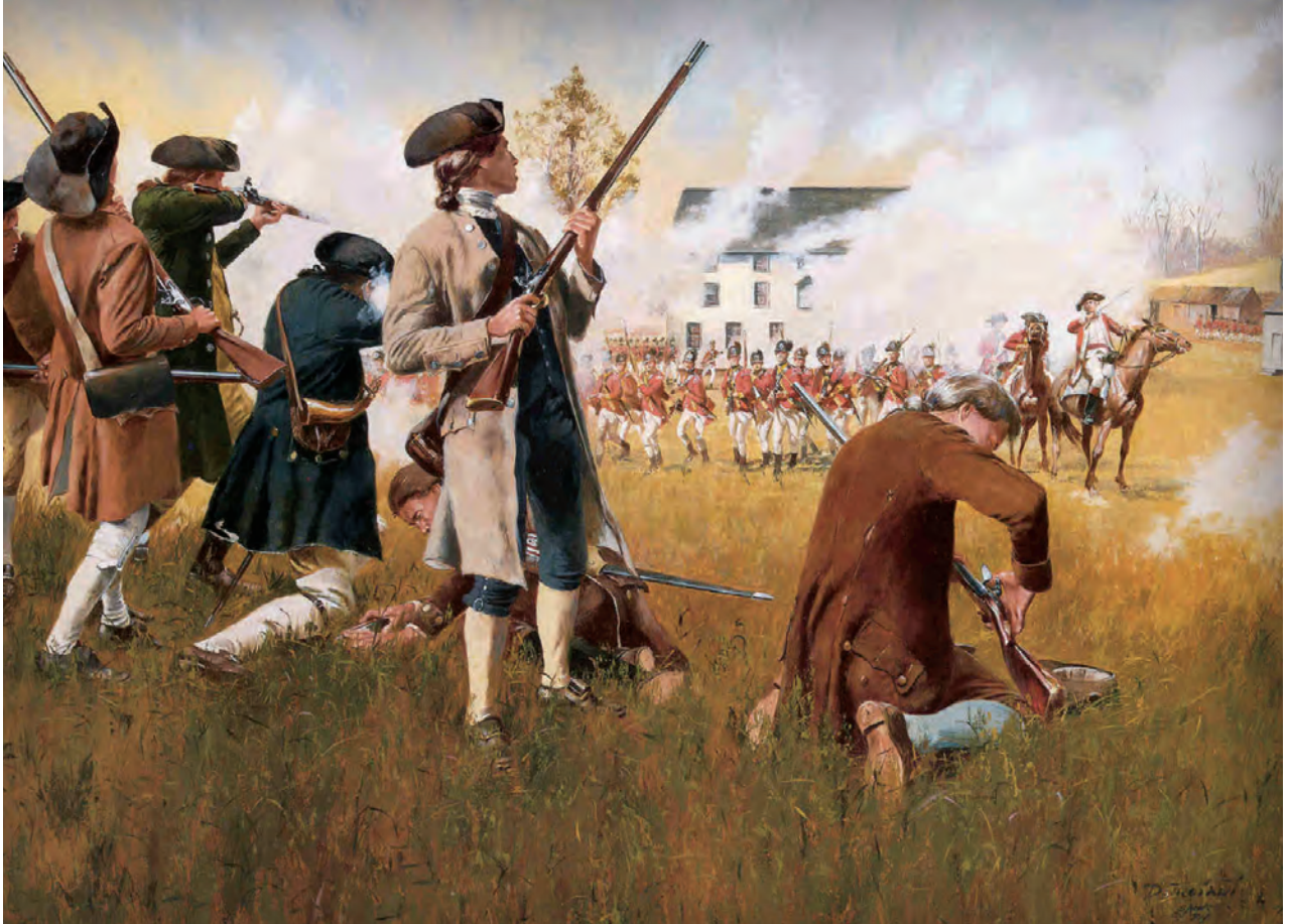
Stand Your Ground, Lexington, Massachusetts, 19 April 1775. In the early hours of 19 April 1775, Captain John Parker was alerted to mobilize the “minutemen” of Lexington, Massachusetts, in anticipation of the British who were marching to Concord to capture provincial arms. Captain Parker’s minutemen fought the first battle of the American Revolution. The “minuteman” was established as a part of the heritage of the Army Reserve by the War Department in 1922. (A National Guard Heritage Painting.)