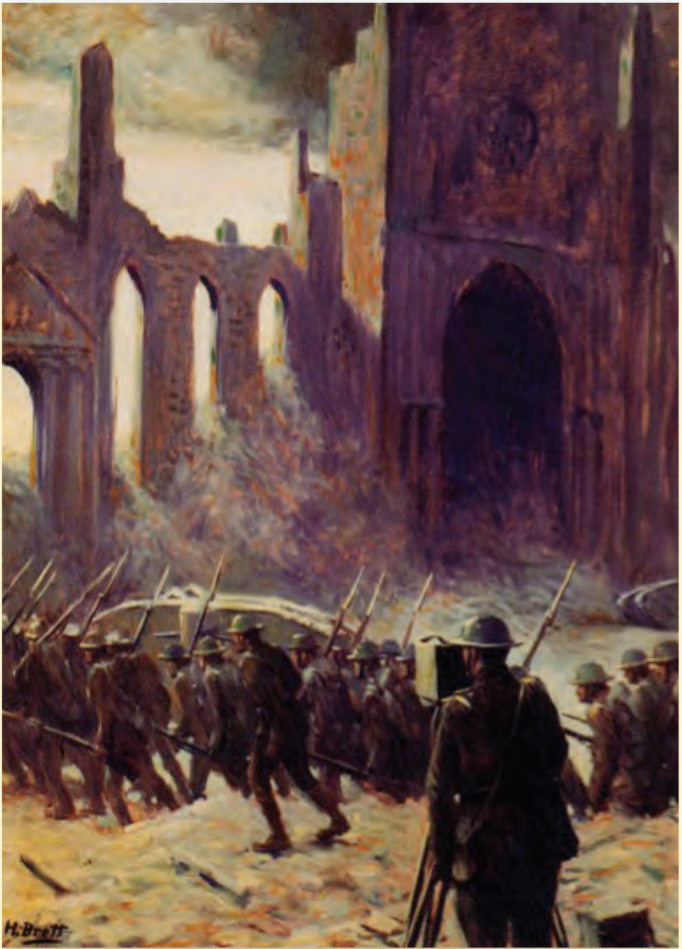
American Troops Advancing, Northern France, Harold Brett. (Courtesy of the Army Art Collection, U.S. Army Center of Military History). The Army mobilized nearly 90,000 Army Reserve officers for World War I. Over 80,000 enlisted Army Reserve soldiers served.